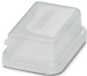
Protective covers, Design: B6, Degree of protection: IP20

Please be informed that the data shown in this PDF Document is generated from our Online Catalog. Please find the complete data in the user's documentation. Our General Terms of Use for Downloads are valid ( http://phoenixcontact.com/download )