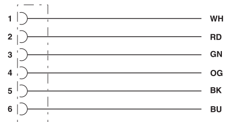
Contact assignment of 7/8" socket