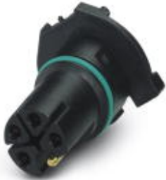
Flush-type connector, Power, 5-position, Socket, straight, L - Power, PCB mounting, THR solder connection

Please be informed that the data shown in this PDF Document is generated from our Online Catalog. Please find the complete data in the user's documentation. Our General Terms of Use for Downloads are valid ( http://phoenixcontact.com/download )