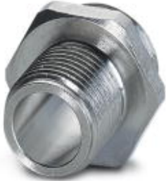
Housing screw connection with M12 standard thread, with O-ring, for 2-piece K, L, and M-coded THR contact carriers

Please be informed that the data shown in this PDF Document is generated from our Online Catalog. Please find the complete data in the user's documentation. Our General Terms of Use for Downloads are valid ( http://phoenixcontact.com/download )