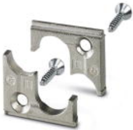
Adapter, Application: Shield adapters

Please be informed that the data shown in this PDF Document is generated from our Online Catalog. Please find the complete data in the user's documentation. Our General Terms of Use for Downloads are valid ( http://phoenixcontact.com/download )