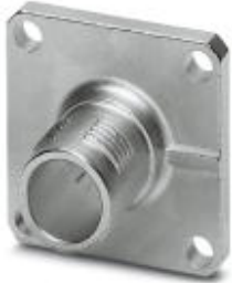
Flange housing, 25 mm x 25 mm

Please be informed that the data shown in this PDF Document is generated from our Online Catalog. Please find the complete data in the user's documentation. Our General Terms of Use for Downloads are valid ( http://phoenixcontact.com/download )