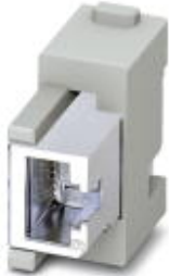
Contact insert module, Number of positions: RJ45, Type: RJ45, Socket, Application: Data, Gender changer

Please be informed that the data shown in this PDF Document is generated from our Online Catalog. Please find the complete data in the user's documentation. Our General Terms of Use for Downloads are valid ( http://phoenixcontact.com/download )