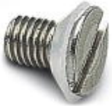
Sealing screw, Size: Countersunk head

Sealing screw - HC-D 7-DS-IP65 - 1686229