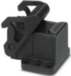
Panel mounting base D7, With single locking latch, Material: Polyamide, Height: 25.5 mm, Cable gland: none, Gland: no, Standard

Please be informed that the data shown in this PDF Document is generated from our Online Catalog. Please find the complete data in the user's documentation. Our General Terms of Use for Downloads are valid ( http://phoenixcontact.com/download )