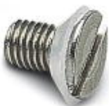
Sealing screw, Size: Countersunk head

Sealing screw - HC-D 7-DS-IP65 - 1686229