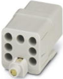
HEAVYCON female insert, D7 series, 7-pos. + PE, crimp connection with coding option

Please be informed that the data shown in this PDF Document is generated from our Online Catalog. Please find the complete data in the user's documentation. Our General Terms of Use for Downloads are valid ( http://phoenixcontact.com/download )