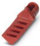
Coding profile for HC-MOD-K... housing