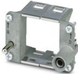
Module carrier frame, Size: B6, Type: for the panel mounting side (a, b, c, ...), 4 mm 2 ... 6 mm 2 , Application: Module carrier frame

Please be informed that the data shown in this PDF Document is generated from our Online Catalog. Please find the complete data in the user's documentation. Our General Terms of Use for Downloads are valid ( http://phoenixcontact.com/download )