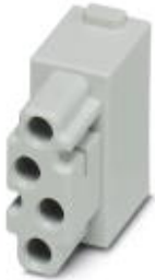
HEAVYCON contact insert module, 4-pos., for HC-M-04-ST-KOAX... coaxial contacts

Please be informed that the data shown in this PDF Document is generated from our Online Catalog. Please find the complete data in the user's documentation. Our General Terms of Use for Downloads are valid ( http://phoenixcontact.com/download )