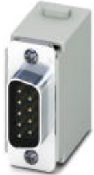
HEAVYCON male contact insert module, D-SUB 9, crimp connection

Please be informed that the data shown in this PDF Document is generated from our Online Catalog. Please find the complete data in the user's documentation. Our General Terms of Use for Downloads are valid ( http://phoenixcontact.com/download )