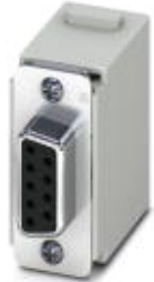
HEAVYCON female contact insert module, D-SUB 9, crimp connection

Please be informed that the data shown in this PDF Document is generated from our Online Catalog. Please find the complete data in the user's documentation. Our General Terms of Use for Downloads are valid ( http://phoenixcontact.com/download )