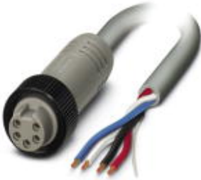
Bus system cable, DeviceNet™, 5-position, PVC, gray, free cable end, A - standard, on Socket straight 7/8"-16UNF, Cable length: 10 m

Please be informed that the data shown in this PDF Document is generated from our Online Catalog. Please find the complete data in the user's documentation. Our General Terms of Use for Downloads are valid ( http://phoenixcontact.com/download )