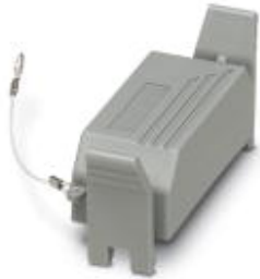
IP67 protective cover

Please be informed that the data shown in this PDF Document is generated from our Online Catalog. Please find the complete data in the user's documentation. Our General Terms of Use for Downloads are valid ( http://phoenixcontact.com/download )