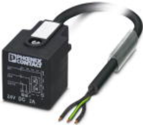
Sensor/Actuator cable, 3-position, PVC, black RAL 9005, free cable end, on Valve connector A, with 1 LED, connected with Damping diode, Cable length: 5 m

Please be informed that the data shown in this PDF Document is generated from our Online Catalog. Please find the complete data in the user's documentation. Our General Terms of Use for Downloads are valid ( http://phoenixcontact.com/download )