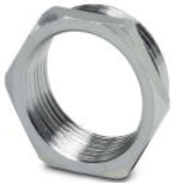
Reducing adapter, Nickel-plated brass, Connecting thread: Pg16

Please be informed that the data shown in this PDF Document is generated from our Online Catalog. Please find the complete data in the user's documentation. Our General Terms of Use for Downloads are valid ( http://phoenixcontact.com/download )