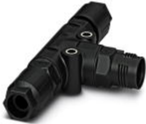
T distributor, QUICKON connection, No. of pos.: 2+PE, 0.5 mm 2 ... 1.5 mm 2 , 690 V, 17.5 A, black, With two QUICKON nuts, Cable diameter: 10 mm ... 13 mm

Please be informed that the data shown in this PDF Document is generated from our Online Catalog. Please find the complete data in the user's documentation. Our General Terms of Use for Downloads are valid ( http://phoenixcontact.com/download )