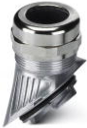
EVO metal cable gland with bayonet locking; size M40, for 5 conductors with 8.5 mm cable diameter

Please be informed that the data shown in this PDF Document is generated from our Online Catalog. Please find the complete data in the user's documentation. Our General Terms of Use for Downloads are valid ( http://phoenixcontact.com/download )