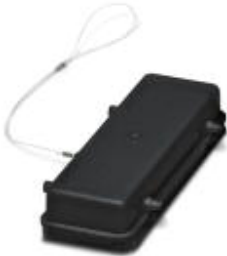
HEAVYCON protective cover, B24, for HC-ECO-B24... sleeve housing, for double locking latch, with retaining cord, IP54, with seal

Please be informed that the data shown in this PDF Document is generated from our Online Catalog. Please find the complete data in the user's documentation. Our General Terms of Use for Downloads are valid ( http://phoenixcontact.com/download )