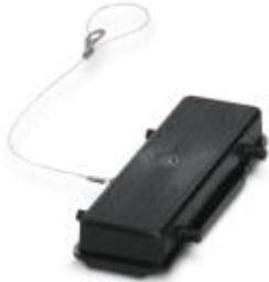
HEAVYCON protective cover, B24, for HC-EVO-B24... supporting base element, for double locking latch, with retaining cord with combination eyelet, IP54

Please be informed that the data shown in this PDF Document is generated from our Online Catalog. Please find the complete data in the user's documentation. Our General Terms of Use for Downloads are valid ( http://phoenixcontact.com/download )