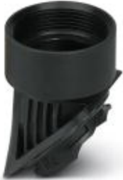
Adapter, plastic, for EVO housing, Pg 29 thread

Please be informed that the data shown in this PDF Document is generated from our Online Catalog. Please find the complete data in the user's documentation. Our General Terms of Use for Downloads are valid ( http://phoenixcontact.com/download )