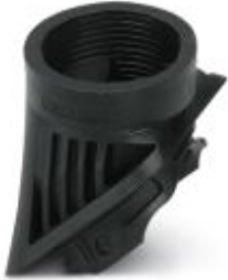
Adapter, plastic, for EVO housing, Pg21 thread

Please be informed that the data shown in this PDF Document is generated from our Online Catalog. Please find the complete data in the user's documentation. Our General Terms of Use for Downloads are valid ( http://phoenixcontact.com/download )