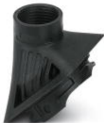
Adapter, plastic, for EVO housing, M20 thread

Please be informed that the data shown in this PDF Document is generated from our Online Catalog. Please find the complete data in the user's documentation. Our General Terms of Use for Downloads are valid ( http://phoenixcontact.com/download )