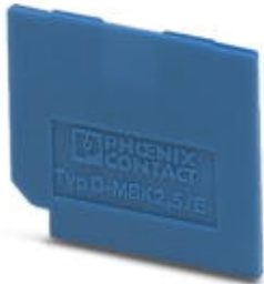
End cover, Length: 24.5 mm, Width: 1 mm, Color: blue

Please be informed that the data shown in this PDF Document is generated from our Online Catalog. Please find the complete data in the user's documentation. Our General Terms of Use for Downloads are valid ( http://phoenixcontact.com/download )