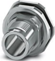
Housing screw connection, Plug, M12-SPEEDCON, Rear mounting, M15 x 1

Please be informed that the data shown in this PDF Document is generated from our Online Catalog. Please find the complete data in the user's documentation. Our General Terms of Use for Downloads are valid ( http://phoenixcontact.com/download )