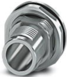
Housing screw connection, Plug, Link: M12-SPEEDCON, Rear mounting, M15 x 1

Please be informed that the data shown in this PDF Document is generated from our Online Catalog. Please find the complete data in the user's documentation. Our General Terms of Use for Downloads are valid ( http://phoenixcontact.com/download )