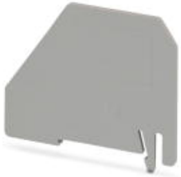
Partition plate, length: 65.3 mm, width: 2 mm, height: 60 mm, color: gray

Please be informed that the data shown in this PDF Document is generated from our Online Catalog. Please find the complete data in the user's documentation. Our General Terms of Use for Downloads are valid ( http://phoenixcontact.com/download )