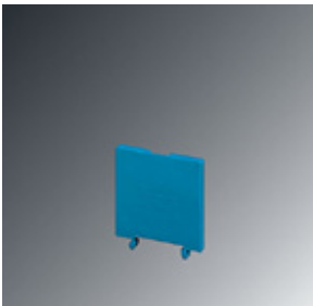
End cover, Length: 28 mm, Width: 2.5 mm, Color: blue

Please be informed that the data shown in this PDF Document is generated from our Online Catalog. Please find the complete data in the user's documentation. Our General Terms of Use for Downloads are valid ( http://phoenixcontact.com/download )