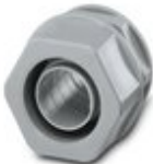
Cable gland made from PP with Pg thread, IP65 protection

Screw connection - WP-G PP HF PG21 - 3240992