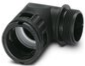
Cable gland, Pg thread, IP68/69k protection, angled

Screw connection - WP-GA HF IP69K PG21 BK - 3240906