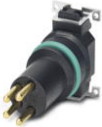
Flush-type connector, 4-position, Plug, Link: straight, Link: M8, A-coded, PCB mounting, SMD

Please be informed that the data shown in this PDF Document is generated from our Online Catalog. Please find the complete data in the user's documentation. Our General Terms of Use for Downloads are valid ( http://phoenixcontact.com/download )