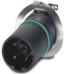
Flush-type connector, 4-position, Plug, straight, M12, D-coded, PCB mounting, SMD

Please be informed that the data shown in this PDF Document is generated from our Online Catalog. Please find the complete data in the user's documentation. Our General Terms of Use for Downloads are valid ( http://phoenixcontact.com/download )