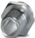
M12 pin, front mounting SMD with M14 screw fastening

Housing screw connection - SACC-FP-M-M12/M14 SMD - 1412078