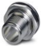
Housing screw connection, Plug, M12, Rear mounting, M15 x 1

Housing screw connection - SACC-BP-M-M12/M15-6-SMD - 1414000