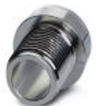
Housing screw connection, pin, for the two-part M12 SMD connector, for press-in mounting.

Housing screw connection - SACC-FP-M-M12/PRESS SMD - 1412080