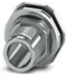
Housing screw connection, Plug, M12-SPEEDCON, Rear mounting, M15 x 1

Housing screw connection - SACC-BP-M-M12/M15-6-SMD SCO - 1414002