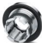
M12 threaded sleeve with tolerance-compensating function, for straight, SMD-solderable M12 socket contact inserts. Suitable for 0.9 mm ... 1.6 mm thick front plates.

Housing screw connection - SACC-BP-F-M12/SMD-0,9/1,6-9TIP - 1419569