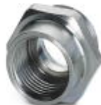
M12 female connector, front mounting SMD with M14 screw fastening

Housing screw connection - SACC-FP-F-M12/M14 SMD - 1412079