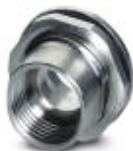
Housing screw connection, Socket, M12, Rear mounting, M15 x 1

Housing screw connection - SACC-BP-F-M12/M15-6-SMD - 1414021