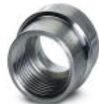
Housing screw connection, socket, for the two-part M12 SMD connector, for press-in mounting.

Housing screw connection - SACC-FP-F-M12/PRESS SMD - 1412081