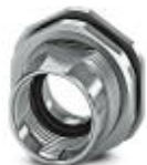
Housing screw connection, Socket, M12-SPEEDCON, Rear mounting, M15 x 1

Housing screw connection - SACC-BP-F-M12/M15-6-SMD SCO - 1414023