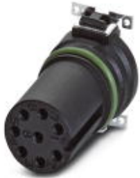
Flush-type connector, 8-position, Socket, straight, M12, A - standard, PCB mounting, SMD

Please be informed that the data shown in this PDF Document is generated from our Online Catalog. Please find the complete data in the user's documentation. Our General Terms of Use for Downloads are valid ( http://phoenixcontact.com/download )