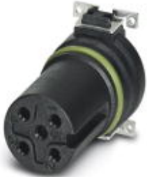
Flush-type connector, 4-position, Socket, Link: straight, Link: M12, A - standard, PCB mounting, SMD

Please be informed that the data shown in this PDF Document is generated from our Online Catalog. Please find the complete data in the user's documentation. Our General Terms of Use for Downloads are valid ( http://phoenixcontact.com/download )