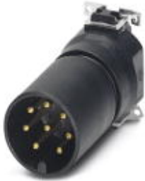
Flush-type connector, 8-position, Plug, straight, M12, A - standard, PCB mounting, SMD

Please be informed that the data shown in this PDF Document is generated from our Online Catalog. Please find the complete data in the user's documentation. Our General Terms of Use for Downloads are valid ( http://phoenixcontact.com/download )