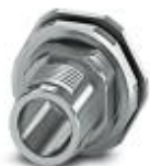
Housing screw connection, Plug, M12-SPEEDCON, Rear mounting, M15 x 1

Housing screw connection - SACC-BP-M-M12/M15-6-SMD SCO - 1414002