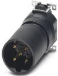
Flush-type connector, 5-position, Plug, straight, M12, B-coded, PCB mounting, SMD

Please be informed that the data shown in this PDF Document is generated from our Online Catalog. Please find the complete data in the user's documentation. Our General Terms of Use for Downloads are valid ( http://phoenixcontact.com/download )