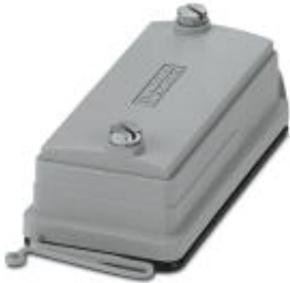
HEAVYCON ADVANCE, IP66, B10 protective cover for panel mounting side, with screw locking, with retaining cord, diameter of retaining cord eyelet: 3 mm

Please be informed that the data shown in this PDF Document is generated from our Online Catalog. Please find the complete data in the user's documentation. Our General Terms of Use for Downloads are valid ( http://phoenixcontact.com/download )