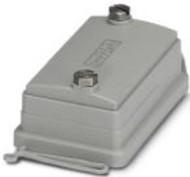
HEAVYCON ADVANCE, IP66, B6 protective cover for panel mounting side, with screw locking, with retaining cord, diameter of retaining cord eyelet: 3 mm

Please be informed that the data shown in this PDF Document is generated from our Online Catalog. Please find the complete data in the user's documentation. Our General Terms of Use for Downloads are valid ( http://phoenixcontact.com/download )