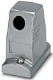
HEAVYCON ADVANCE standard powder-coated B10 sleeve housing, with screw locking, height: 100 mm, with 1 x M40 thread, lateral cable outlet

Please be informed that the data shown in this PDF Document is generated from our Online Catalog. Please find the complete data in the user's documentation. Our General Terms of Use for Downloads are valid ( http://phoenixcontact.com/download )