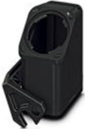
HEAVYCON EVO coupling housing, plastic, with bayonet flange for EVO screw connection, B10, with single locking latch, height: 90 mm, without EVO screw connection

Please be informed that the data shown in this PDF Document is generated from our Online Catalog. Please find the complete data in the user's documentation. Our General Terms of Use for Downloads are valid ( http://phoenixcontact.com/download )