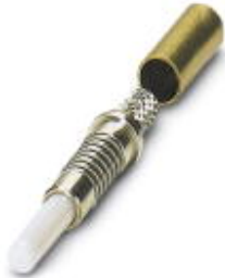
Replacement ferrule set (10 pcs.) for M12 PCF fiber optic connector (Order No. 1416619)

Please be informed that the data shown in this PDF Document is generated from our Online Catalog. Please find the complete data in the user's documentation. Our General Terms of Use for Downloads are valid ( http://phoenixcontact.com/download )