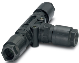
QUICKON T-distributor, black, 4+PE-pos., 1.0 mm 2 ... 2.5 mm 2 /690 V/20 A, for cable diameter of 9 mm ... 16 mm, with three QUICKON nuts

Please be informed that the data shown in this PDF Document is generated from our Online Catalog. Please find the complete data in the user's documentation. Our General Terms of Use for Downloads are valid ( http://phoenixcontact.com/download )