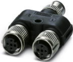
Y distributor, 3-position, unshielded, Plug straight M12 SPEEDCON, A-coded, on Socket straight M12 SPEEDCON, A-coded and Socket straight M12 SPEEDCON, A-coded, with 3 LEDs

Please be informed that the data shown in this PDF Document is generated from our Online Catalog. Please find the complete data in the user's documentation. Our General Terms of Use for Downloads are valid ( http://phoenixcontact.com/download )