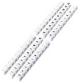
BNB Zack marker strip, 10-section, divisible, horizontally labeled with the consecutive numbers: 81 ... 90, white

Please be informed that the data shown in this PDF Document is generated from our Online Catalog. Please find the complete data in the user's documentation. Our General Terms of Use for Downloads are valid ( http://phoenixcontact.com/download )