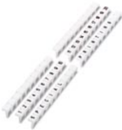
BNB Zack marker strip, 10-section, divisible, horizontally labeled with the consecutive numbers: 41 ... 50, white

Please be informed that the data shown in this PDF Document is generated from our Online Catalog. Please find the complete data in the user's documentation. Our General Terms of Use for Downloads are valid ( http://phoenixcontact.com/download )