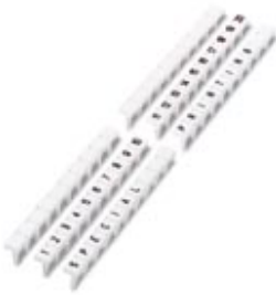
BNB Zack marker strip, 10-section, divisible, horizontally labeled with the consecutive numbers: 31 ... 40, white

Please be informed that the data shown in this PDF Document is generated from our Online Catalog. Please find the complete data in the user's documentation. Our General Terms of Use for Downloads are valid ( http://phoenixcontact.com/download )