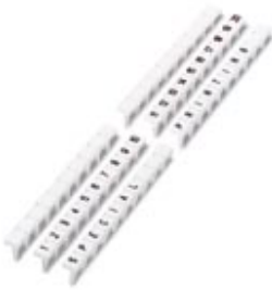
BNB Zack marker strip, 10-section, divisible, horizontally labeled with the consecutive numbers: 21 ... 30, white

Please be informed that the data shown in this PDF Document is generated from our Online Catalog. Please find the complete data in the user's documentation. Our General Terms of Use for Downloads are valid ( http://phoenixcontact.com/download )