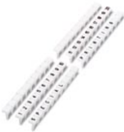
BNB Zack marker strip, 10-section, divisible, horizontally labeled with the consecutive numbers: 11 ... 20, white

Please be informed that the data shown in this PDF Document is generated from our Online Catalog. Please find the complete data in the user's documentation. Our General Terms of Use for Downloads are valid ( http://phoenixcontact.com/download )