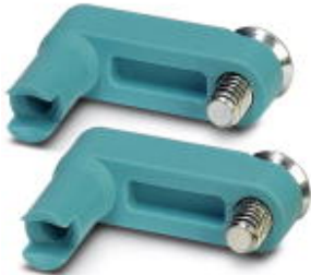
Replacement cable routing, for CF 3000-TOOLKIT 0,25

Please be informed that the data shown in this PDF Document is generated from our Online Catalog. Please find the complete data in the user's documentation. Our General Terms of Use for Downloads are valid ( http://phoenixcontact.com/download )